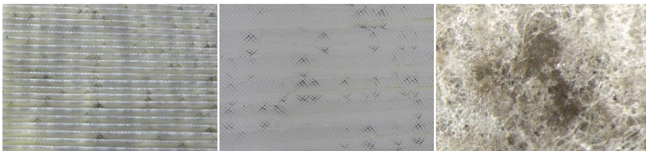
Filter materials with discharge traces when using zinc and ash-free oil.